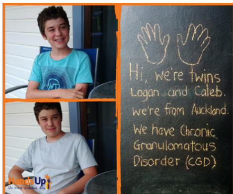
Some of the "Hands Up" Facebook posts.