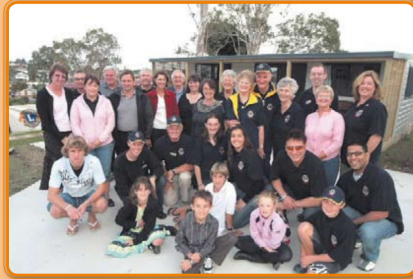
Remuera Lions Club Members outside